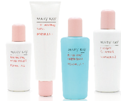
Classic Basic® Skin Care