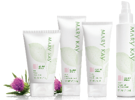
Botanical Effects™ Skin Care